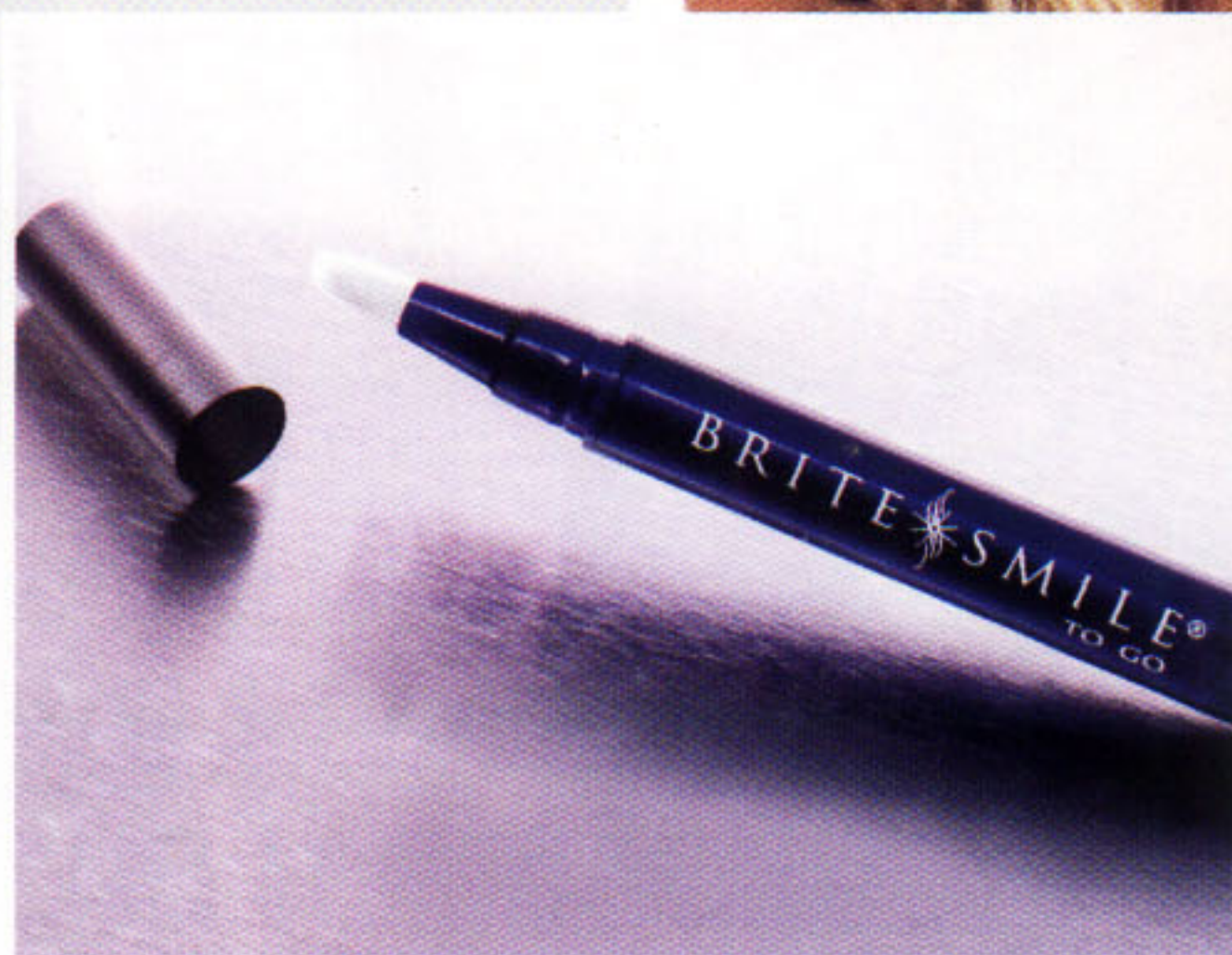
Retouch your white teeth constantly after your laser treatments through the BriteSmile whitening pen

the teeth. Using a special machine, teeth are exposed to laser light for three cycles at 20 minutes each. After one hour, voila! Your teeth are eight to 15 times whiter than before.